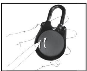
2. On the back of the lock, use a pointed object to slide the reset lever into the "up" position (toward the "R").